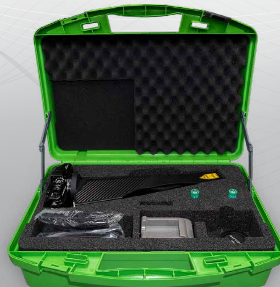
Figure: Device case with STT shaft twist tester NK

The disturbed periodicity leads to a non continuous stripe pattern. Above a period length of 200 \mu m the spacing between the diffraction lines is very small and it is difficult to resolve it with human eye. The pictures recorded by the video camera are magnified by a factor 4 and displayed on a screen. That leads to a clearly improved resolution of long wave twist structures (200 \mu m - 500 \mu m). The STT R100 NV is principally designed for the stationary 100%-inspection of seal seat surfaces close to the manufacturing process and is connected to a video camera and a screen. The Video camera can also be readout by a PC via a standard TV tuner card. The disturbed diffraction lines pattern can be compacted to standing lines, while rotating the shaft between centres or in the lathe chuck, which indicates the presence of twist.